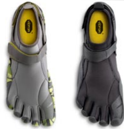
M135 & W135